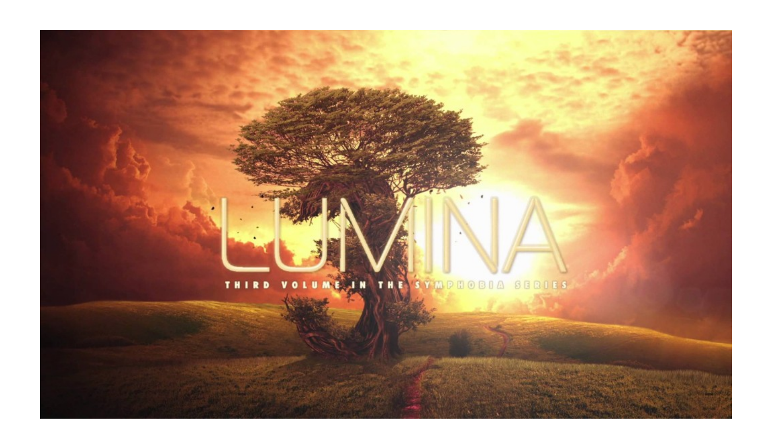
Project Sam Symphobia Keygen For Mac